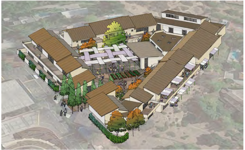
2018 Stephen Wise Early Childhood Center Concept Design Team Member - Illustrations School Expansion Encino, California (Un-Built)