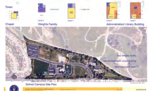
2011 Mary Star of the Sea Concept Design Team Member High School Expansion Master Plan San Pedro, California (On-Going)